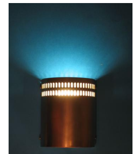
Use as an Up Light or as a Down Light.