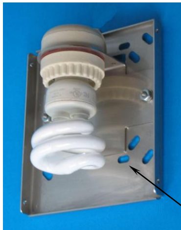
Highly Reflective Interior